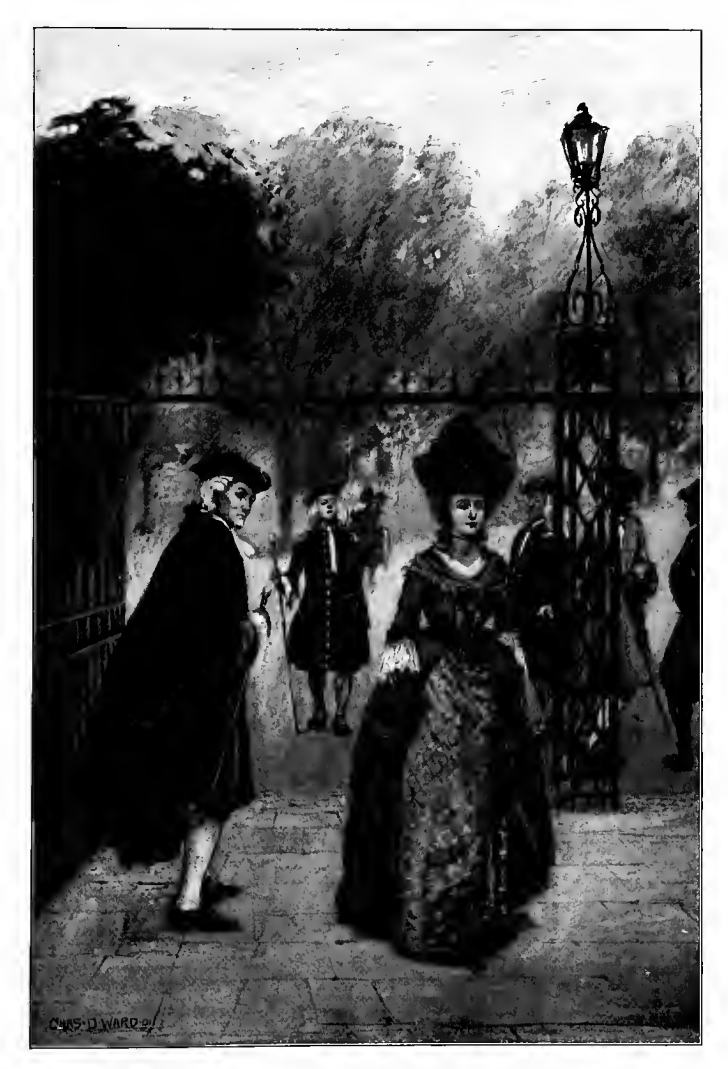
JUST AS SHE PASSED THROUGH THE GATES SHE WAS MET BY A YOUNG LAWYER,